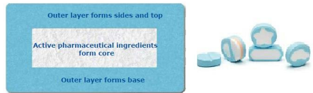
Figure 2: OSDrC® OptiDose™ tablets