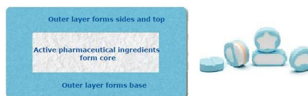
Figure 2: OSDrC® OptiDose™ tablets