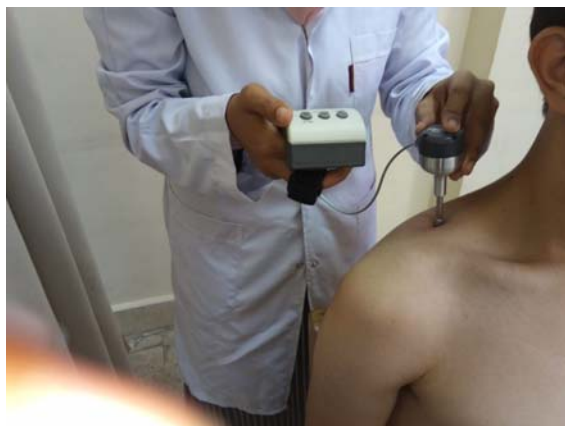
Figure 2: PPT assessment.