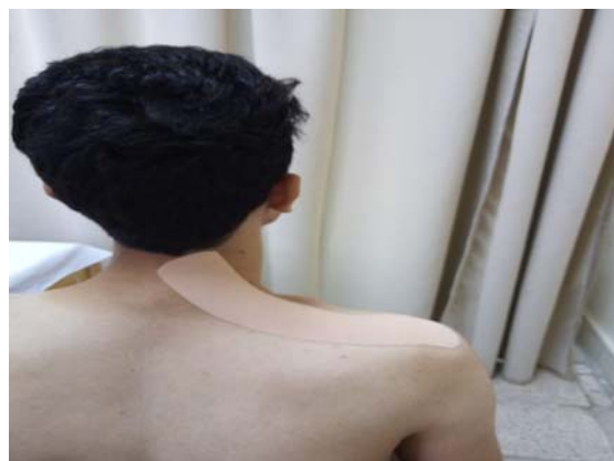
Figure 3: KT application

The subject was seated in a comfortable position. Then, the taped area was exposed, shaved and cleaned with alcohol. The measurement of the tape began from the origin of the muscle at the middle of the acromion to the insertion at the hairline on the nape of the neck. In the resting state, the base of KT was taped at the insertion site at the acromion. Then, the upper trapezius was stretched by applying side bending to the opposite side and rotation to the same side with slight flexion. KT was taped with 10% tension over the belly of the muscle to the point of origin. The tape was rubbed in the elongated muscle position [24] (figure 3).