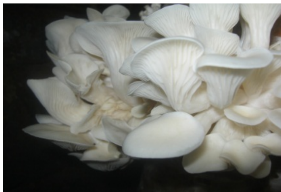
Figure 3: mushroom cultivated on wheat straw