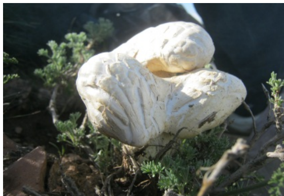
Figure 1: Pleurotous Eryngii

then, inseminated by pleurotous eryngii mushroom at a ratio of 3% to 5% and were transferred to the culture room.