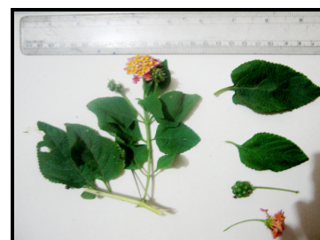
Figure 1: Lanata camara

Kingdom : Plantae Order : Lamiales Family : Verbenaceae Genus : Lantana Species : camara