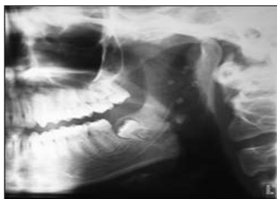
Figure 2: Orthopantomogram reveals multiple phleboliths in the left ramus region