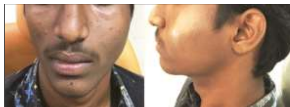
Figure 1: Reveals facial asymmetry with swelling on the left malar region of the face